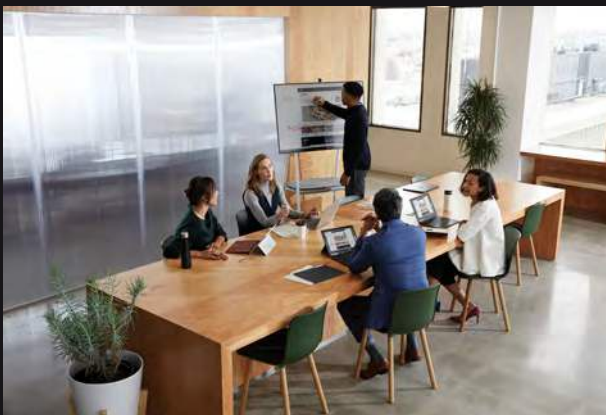
Accelerate productivity and efficiency

Learn how to gain customer loyalty by reinventing your business around the customer to deliver the personalised experiences they expect. Taking your organisation on a journey from paper heavy to paper light or even paperless is essential. Here's why.