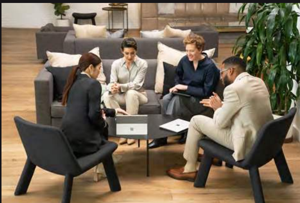
Enhance experiences for all