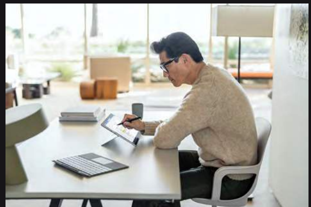
Improve sustainability efforts

The paperless experience with premium Surface 2-in-1 devices offering flexible form factors with touch screen, Surface Slim Pen for a world class digital inking experience and Adobe Acrobat productive and secure software are the perfect combination for organisations to deliver in these four critical areas, while upholding the highest standard of professionalism.