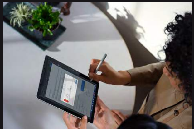
Increase security and compliance