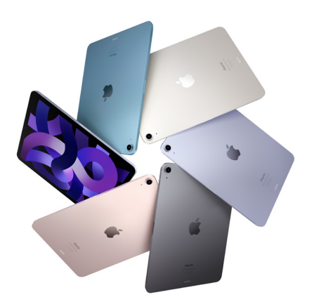
iPad Air. Powerfully versatile. Seriously productive.