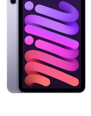
iPad mini. Small is the new powerful for your business.

iPad Air. With the breakthrough Apple M1 chip, it effortlessly runs built-in productivity apps and popular business apps like Office 365, Google Workspace and Workday. It securely connects to your business and teams wherever you are with blazing-fast 5G<sup>1</sup> and Wi-Fi 6, and supports the Magic Keyboard and Apple Pencil.<sup>2</sup>