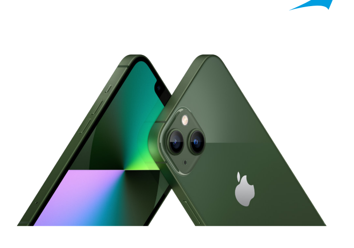
iPhone 13. Your new superpower for business.

<sup>2</sup>Display size is measured diagonally.