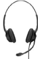
IMPACT 200 Series