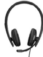
ADAPT 100 Series