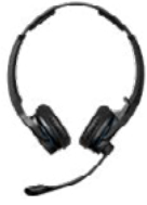
IMPACT MB Pro Series