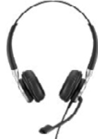
IMPACT 600 Series