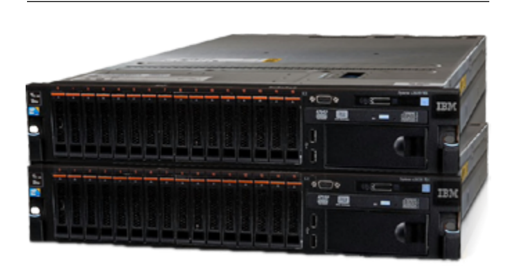
IBM PureData System for Analytics N3001-001 appliance

Powered by IBM Netezza® technology, the PureData Mini Appliance includes an asymmetric, massively parallel processing architecture that is optimized to run complex analytics on terabyte data volumes—10 to 100 times faster than traditional custom systems.<sup>1</sup> Fast query performance on analytical workloads enables rapid, responsive decision making anytime, anywhere to manage risk, enhance service quality, and improve business strategy and efficiency. With the ability to view information and events as they unfold, line-ofbusiness managers can make smart predictions about customer needs and behaviors that drive revenue, increase loyalty and enhance satisfaction.